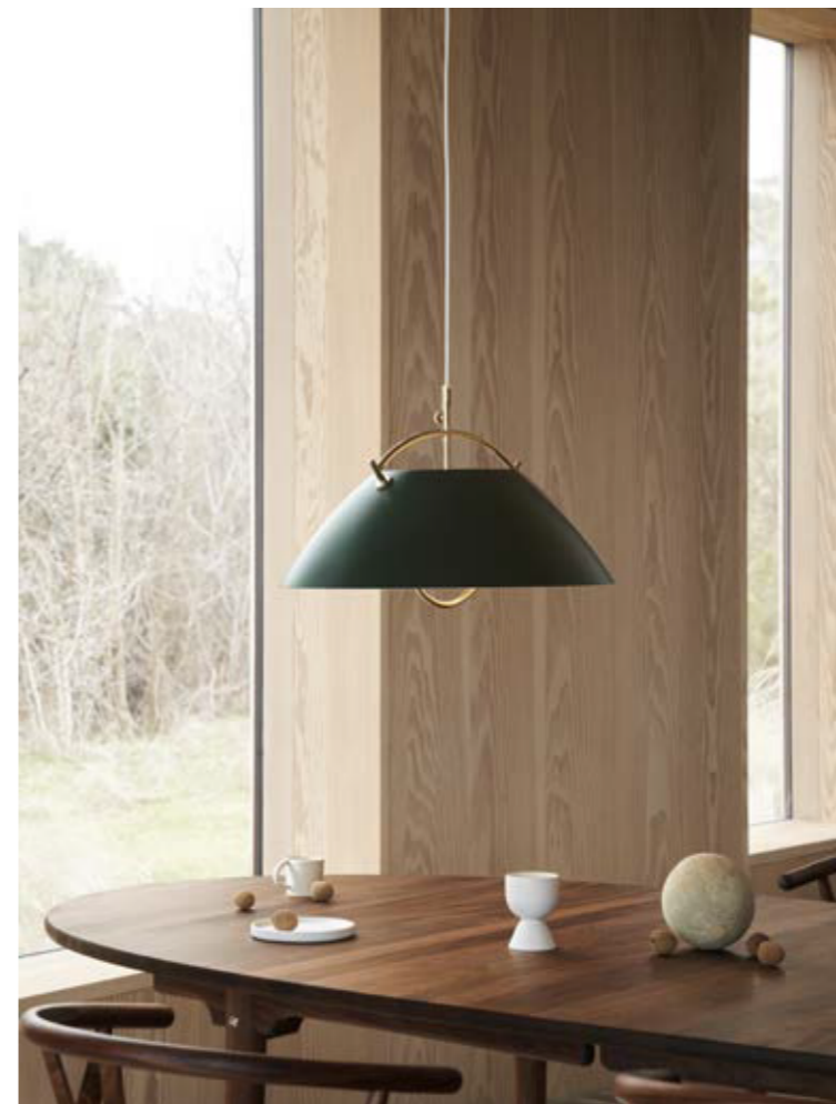
HJW37 The Pendant, CH24 Wishbone Chair, CH339 Dining Table Shade: aluminium dark green. Hanger: gold

Among Danish furniture designers, Hans J. Wegner is considered one of the most creative, innovative, and prolific. Being world-famous for his iconic chair and furniture designs, Wegner also experimented with other categories such as silverware, wallpaper, and lighting, which all have his organic modernism trademark in common. Wegner's use of industrial materials such as steel and acrylic gave a new dimension to his portfolio of design, and his lamps from the 1960s and 1970s prove that he kept on being visionary throughout his career.