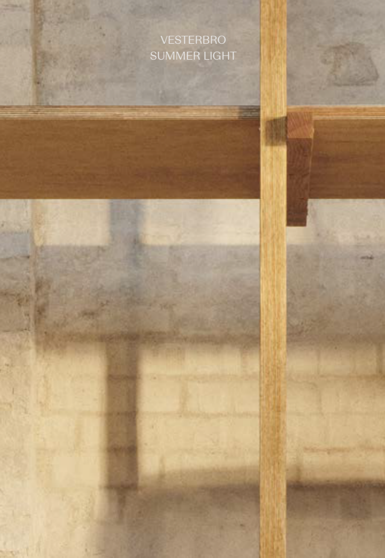
VESTERBRO SUMMER LIGHT