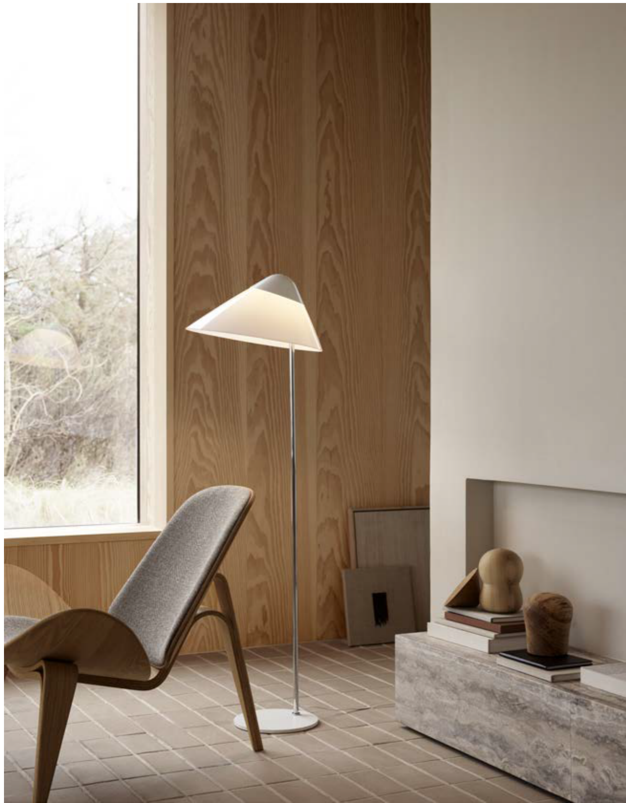
HJW03 Opala Floor Lamp Midi, CH07 Shell Chair Shade: opal acrylic. Top and foot: aluminium white. Rod: steel