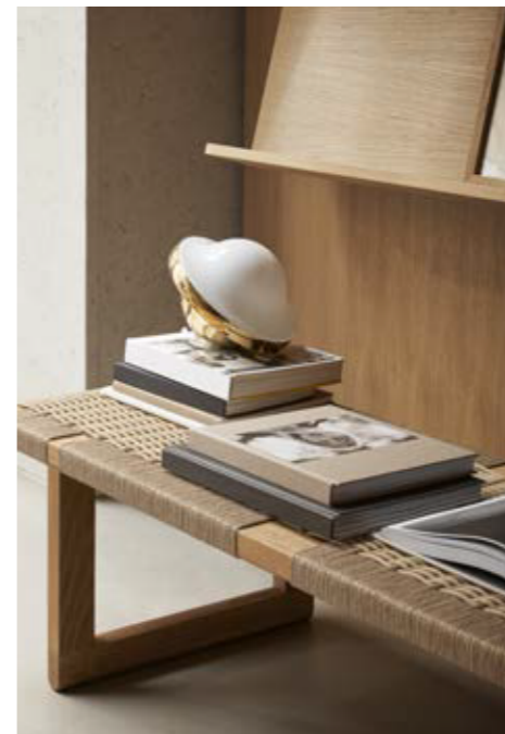
HK20 Bubi Lamp, BMO489L Table Bench Shade: opal acrylic. Top: brass