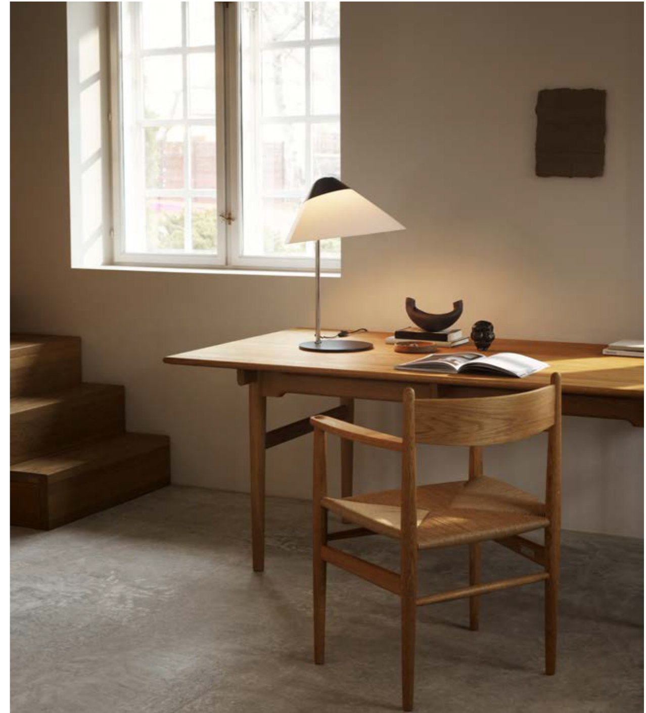
HJW02 Opala Table Lamp Midi, CH37 Chair, CH327 Dining Table Shade: opal acrylic. Top and foot: aluminium black. Rod: steel