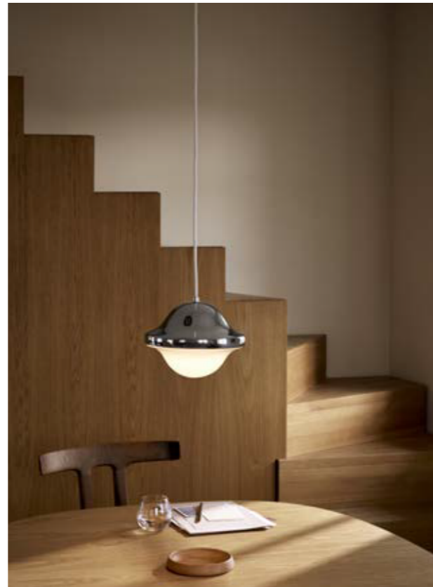
HK20 Bubi Lamp, OW58 T-Chair, OW224 Rungstedlund Table Shade: opal acrylic. Top: chrome