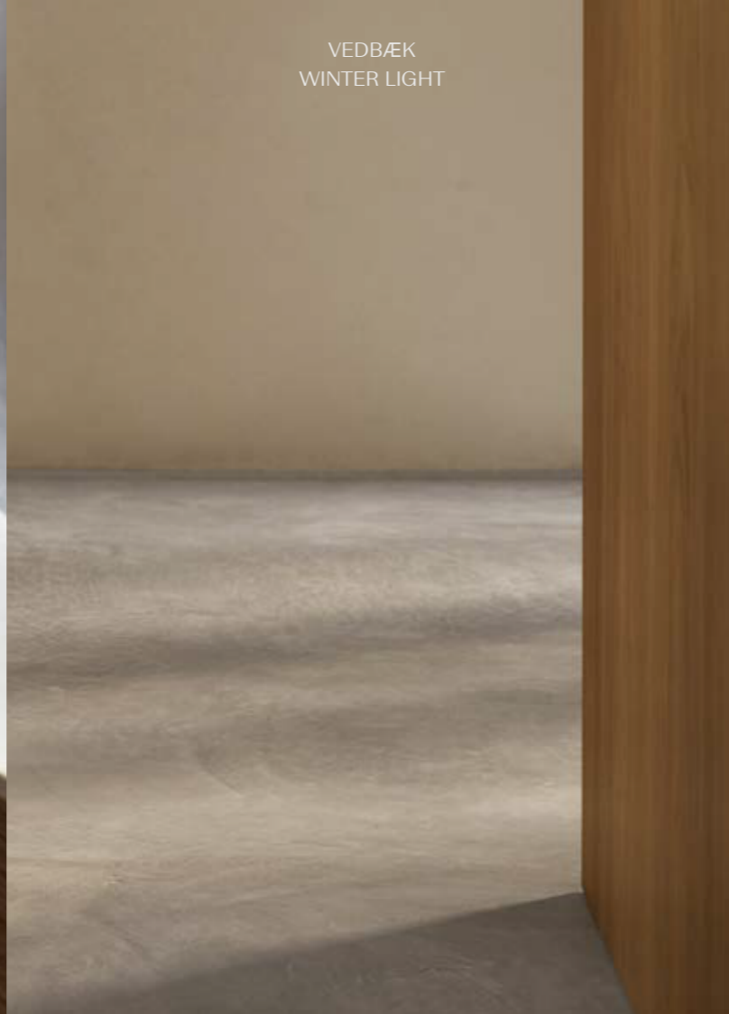
VEDBÆK WINTER LIGHT