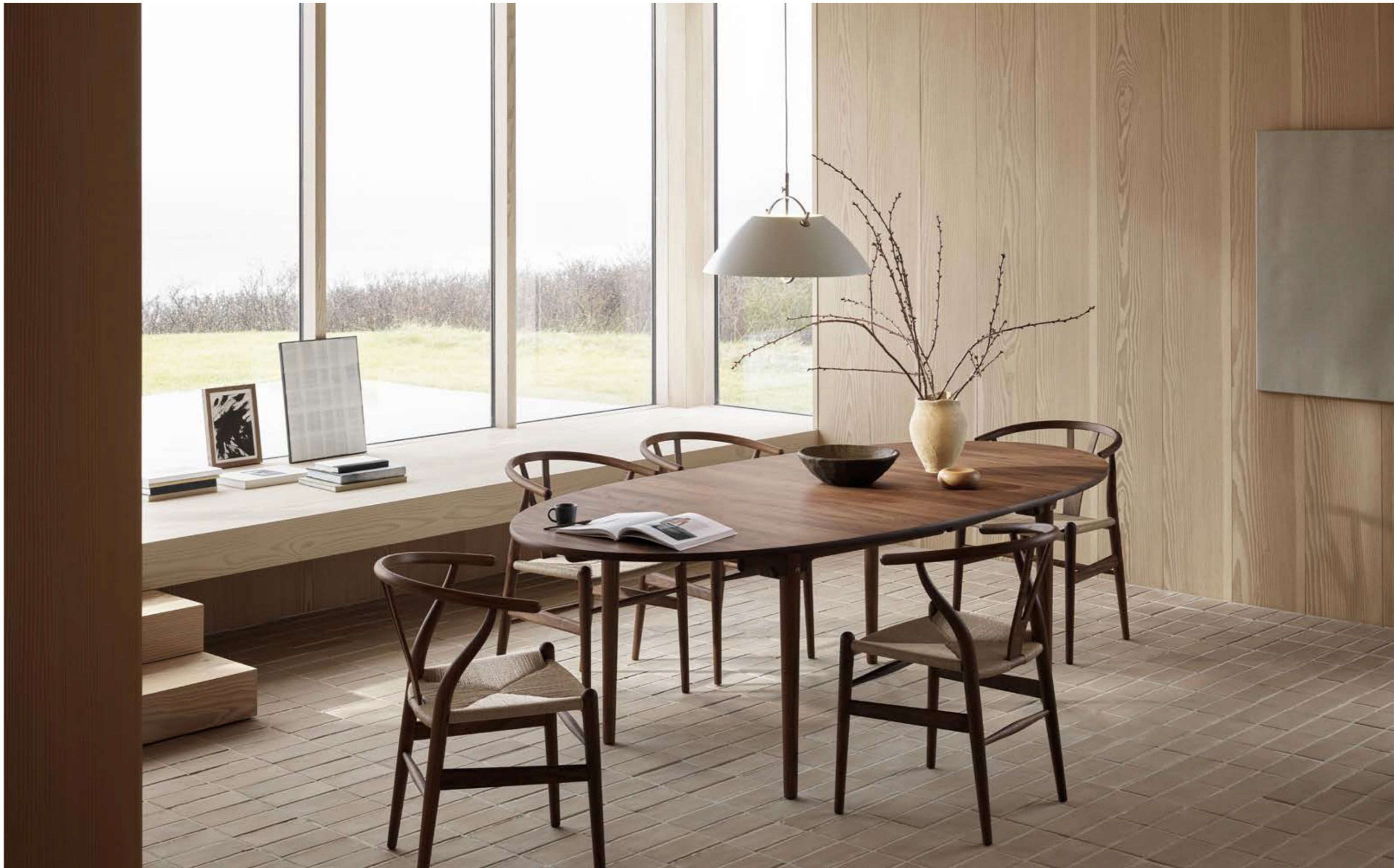
HJW37 The Pendant, CH24 Wishbone Chair, CH339 Dining Table Shade: aluminium white. Hanger: steel