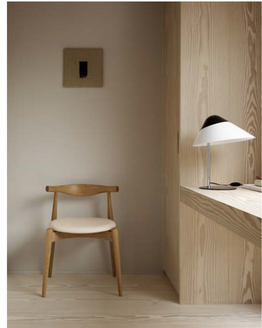
HJW02 Opala Table Lamp Mini, CH20 Elbow Chair Shade: opal acrylic. Top and foot: aluminium black. Rod: steel