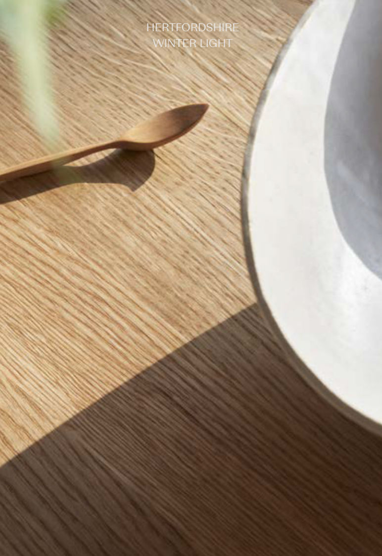
HERTFORDSHIRE WINTER LIGHT