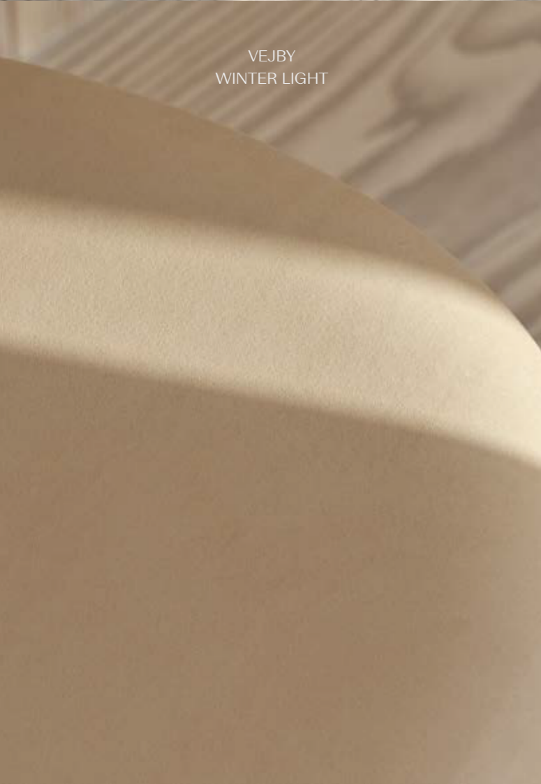
VEJBY WINTER LIGHT