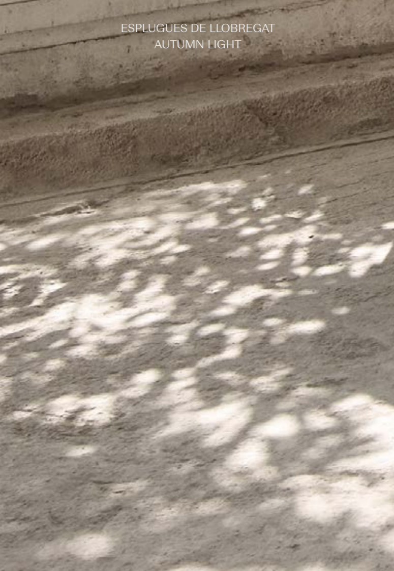
ESPLUGUES DE LLOBREGAT AUTUMN LIGHT