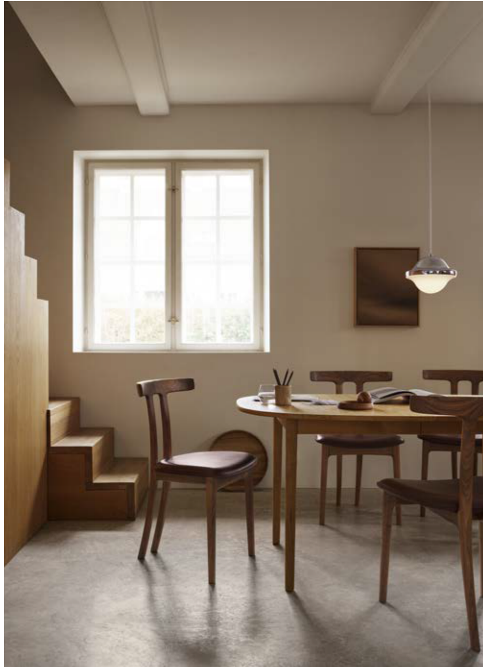
HK20 Bubi Lamp, OW58 T-Chair, OW224 Rungstedlund Table Shade: opal acrylic. Top: chrome