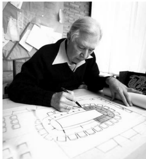
HANS J. WEGNER 1914-2007

Among Danish furniture designers, Hans J. Wegner is considered one of the most creative, innovative, and prolific. Being world-famous for his iconic chair and furniture designs, Wegner also experimented with other categories such as silverware, wallpaper, and lighting, which all have his organic modernism trademark in common. Wegner's use of industrial materials such as steel and acrylic gave a new dimension to his portfolio of design, and his lamps from the 1960s and 1970s prove that he kept on being visionary throughout his career.