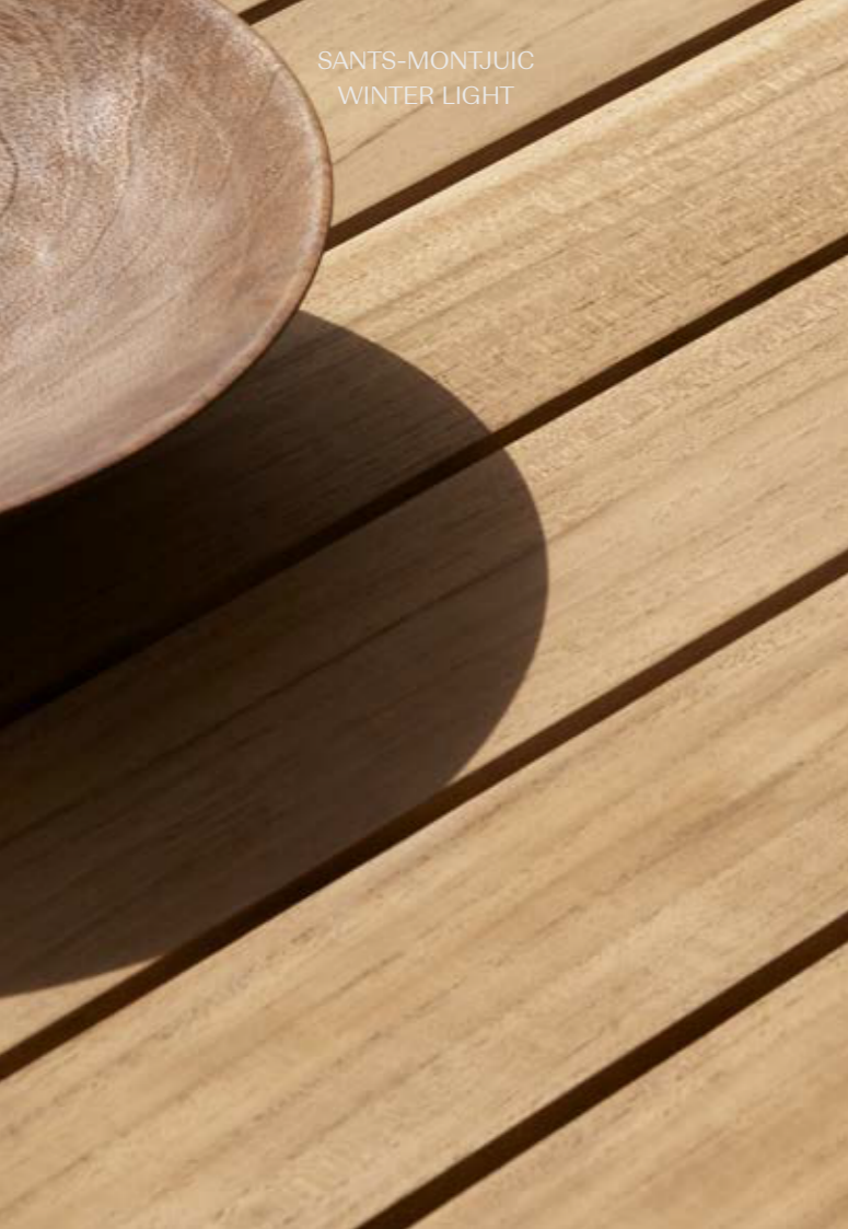
SANTS-MONTJUIC WINTER LIGHT