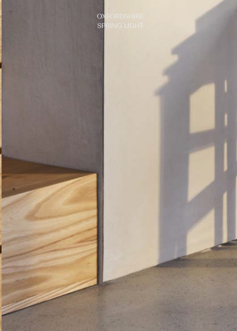
OXFORDSHIRE SPRING LIGHT