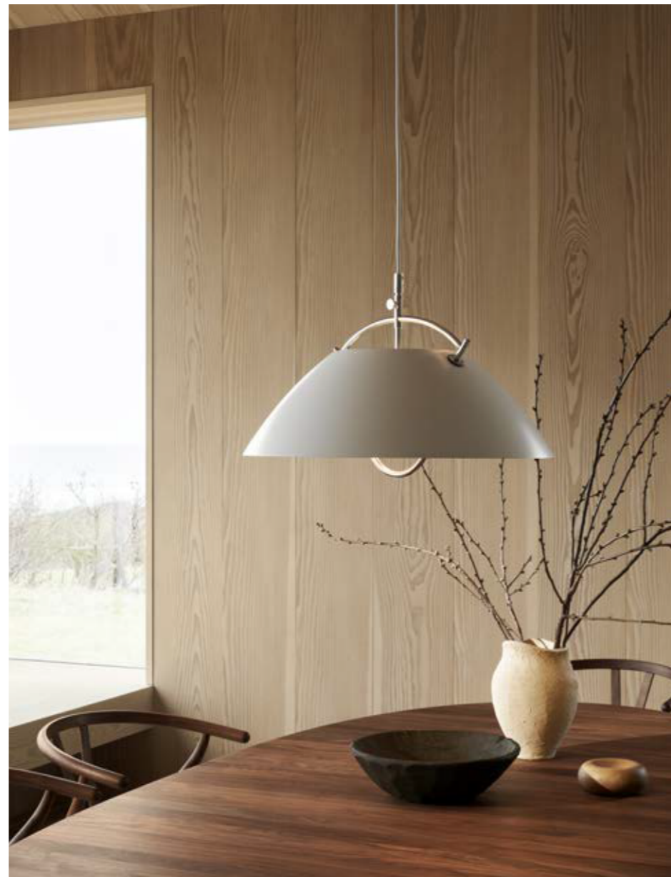
HJW37 The Pendant, CH24 Wishbone Chair, CH339 Dining Table Shade: aluminium white. Hanger: steel