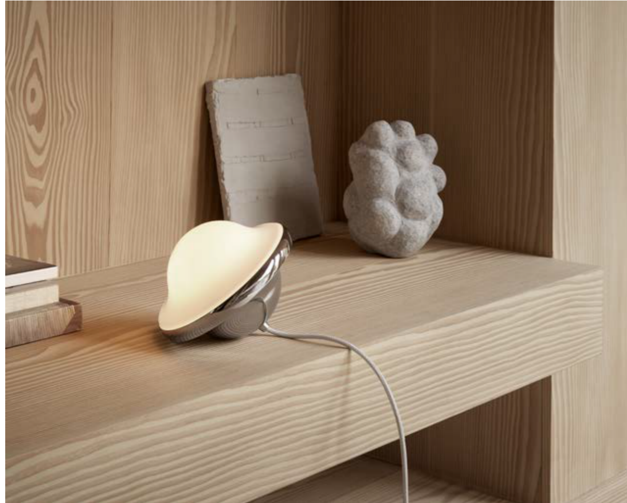
HK20 Bubi Lamp Shade: opal acrylic. Top: chrome