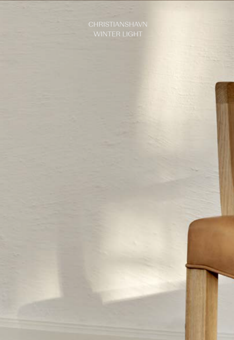
CHRISTIANSHAVN WINTER LIGHT