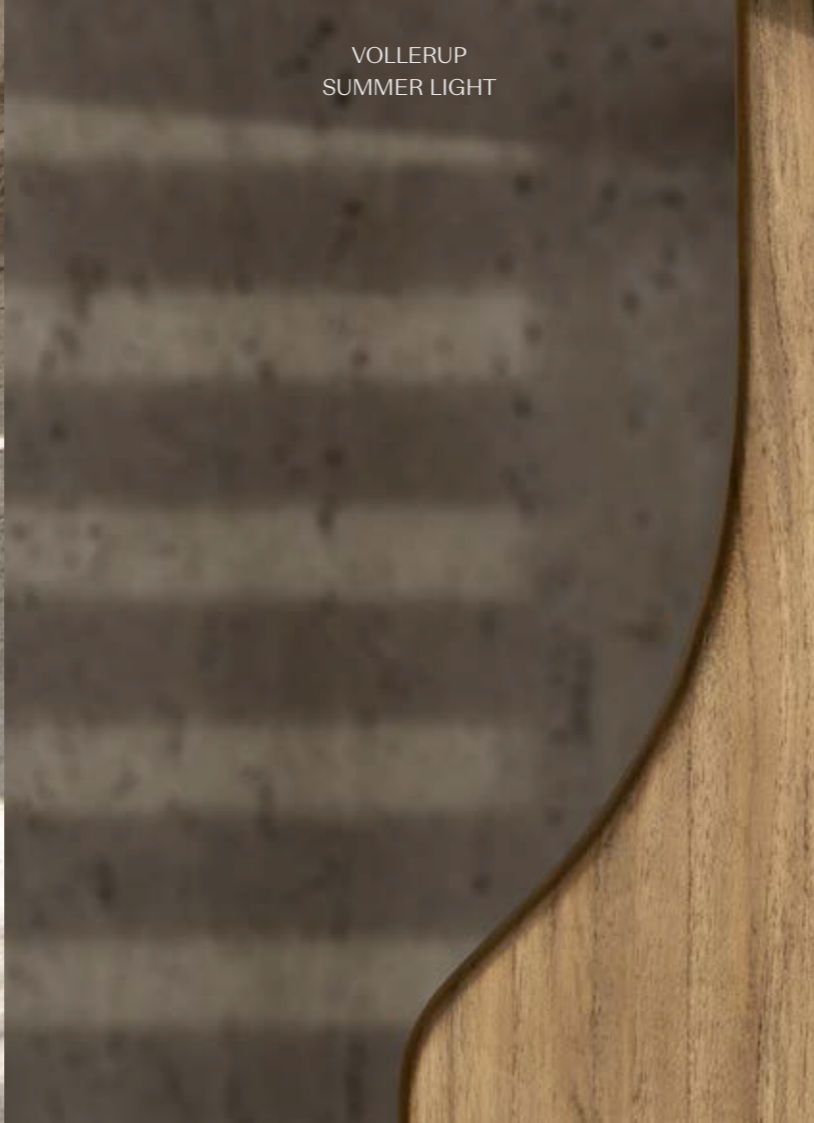
VOLLERUP SUMMER LIGHT